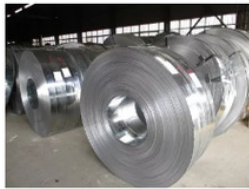
1: Selection of raw materials